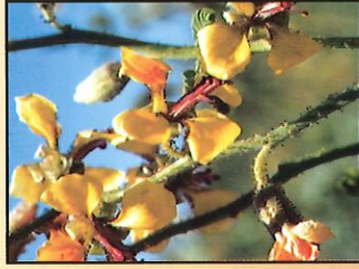
Pignut ( Hoffmannseggia densiflora )