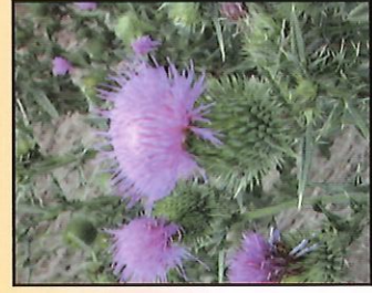
Bull thistle ( Cirsium vulgare ) - County optional -