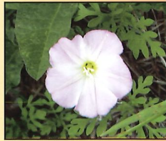
Field Bindweed ( Convolvulus arvensis )