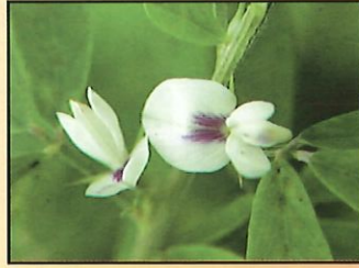
Sericea lespedeza ( Lespedeza cuneata )