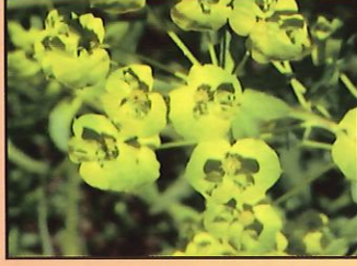
Leafy spurge ( Euphorbia esula )