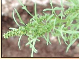
Bur ragweed ( Ambrosia grayii )