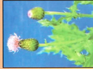
Canada thistle ( Cirsium arvense )