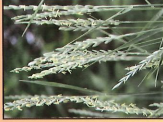
Quackgrass ( Agropyron repens )