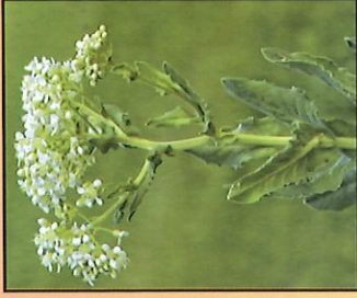
Hoary cress ( Cardaria draba )