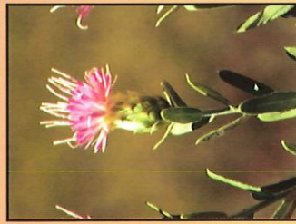
Russian knapweed ( Centaurea repens )