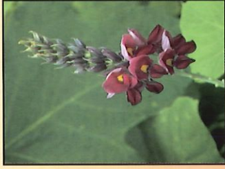
Kudzu ( Pueraria lobata )