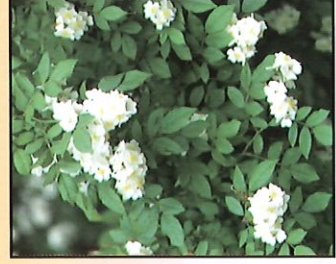
Multiflora rose ( Rosa multiflora ) - County optional -

1320 Research Park Drive Manhattan, KS 66502 Phone: 785-564-6698 Fax: 785-564-6779 agriculture.ks.gov/divisions-programs/plant-protect-weed-control