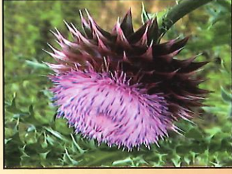
Musk thistle ( Carduus nutans )